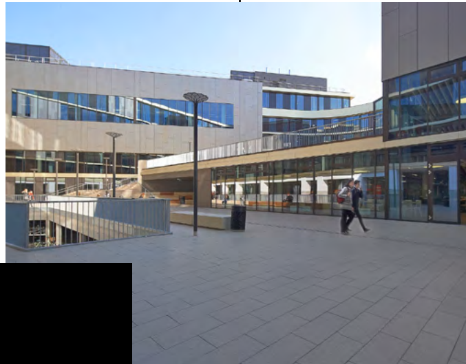
KAREL DE GROTE | High school Antwerp

“Our school environments meet both current needs and future challenges.”