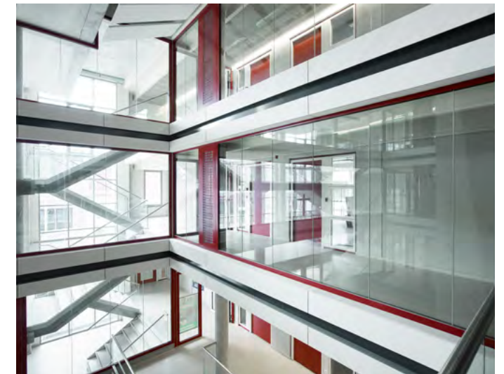
DON BOSCO | Secondary school Brussels

For organizing fire safety zones and suitable escape routes for evacuations , Beddeleem provides a suitable solution with the JB FIREGLASS glazed partition and associated door units with high fire resistance.