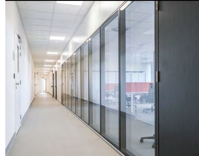
VIB UGENT | Research center Zwijnaarde

Our JB 2000 range of relocatable partitions (solid and glazed) is ideal for easily adapting classrooms to different sizes and purposes. The elements are 100% interchangeable.